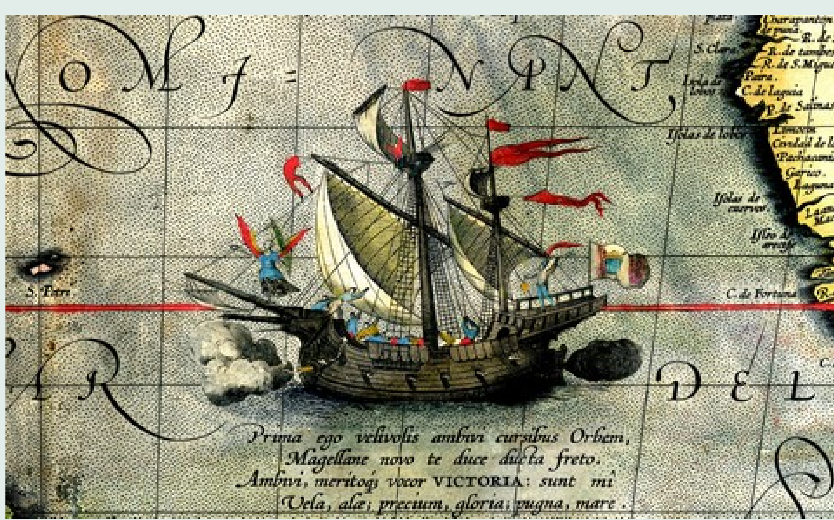
A map from 1590 detailing Magellan's Ship "Victoria"

Magellan gave the name "Pacific" (Spanish for 'peaceful') to the ocean he saw when he came out of the strait.